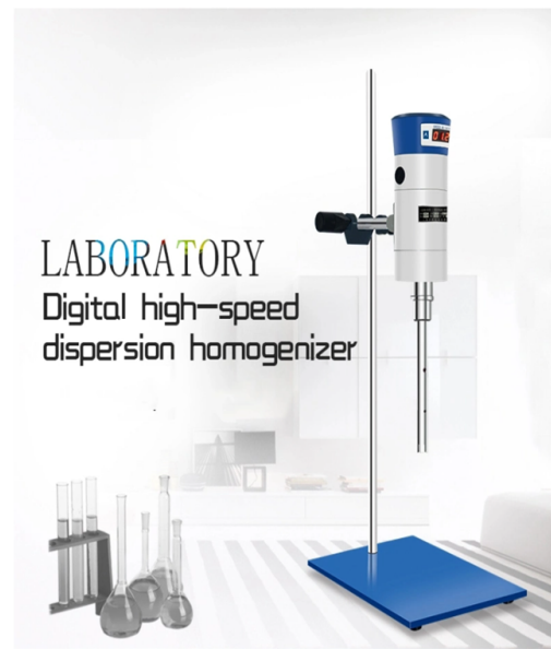
LABORATORY Digital high-speed dispersion homogenizer

Guangzhou Yalian is a large-scale company specialized in design, manufacturing, installation and commissioning of daily chemical, chemical, food and pharmaceutical machinery, as well as water treatment equipment. With powerful technical strength, complete inspection facilities, unique and advanced technique as well as great varieties of products, the enterprise strictly implements ISO9001 standard management.