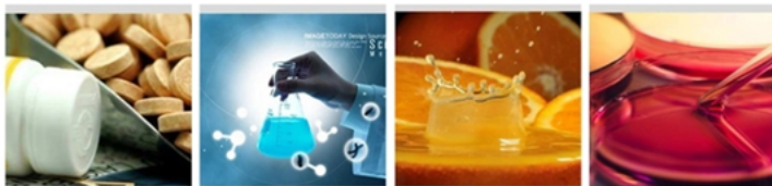
Medicine Biochemistry Food and drinks Make ups